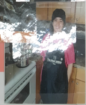
Feed the Homeless → In San Jose Hot Thanksgiving Meals on Nov 26, 2017