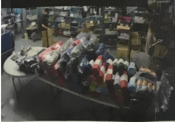
← Carepackages for the Homeless event in Redwood City on Feb. 11, 2018